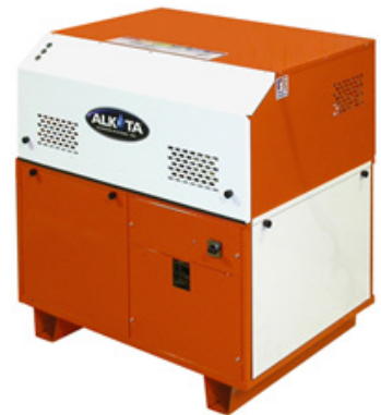
Alkota Wash Bay CW Unit 530B ETL