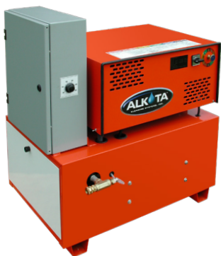
Alkota All Electric HW Unit 4208 ETL