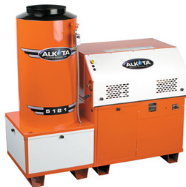
Alkota Natural Gas HW Unit 5181 AEUL